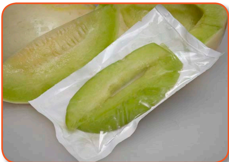
Tamper Evident - Easy to Open