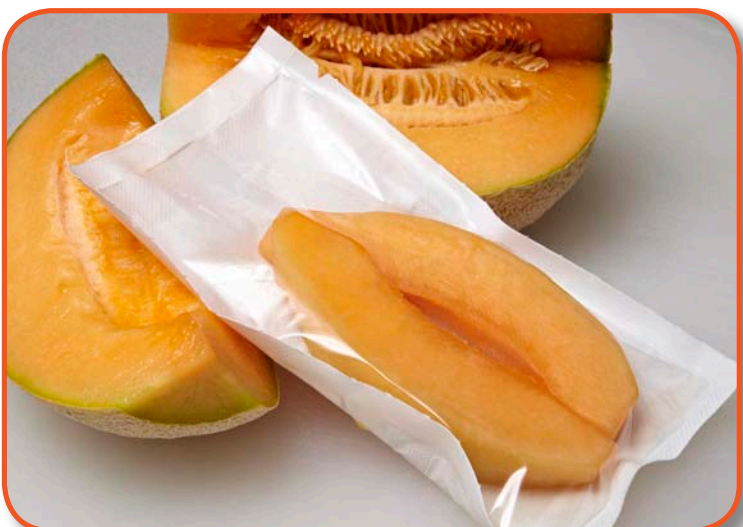
Fun to Eat - No Dripping

Absorbent Packaging That Delivers Freshness and Extended Shelf Life!