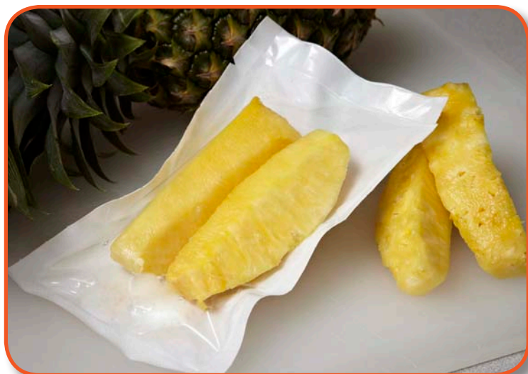
Great For Convenient Stores