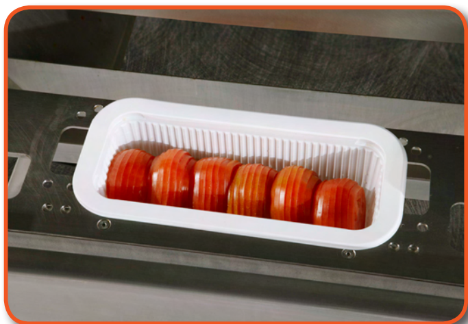
Produces uniform, clean cut tomato slices to a standard thickness.