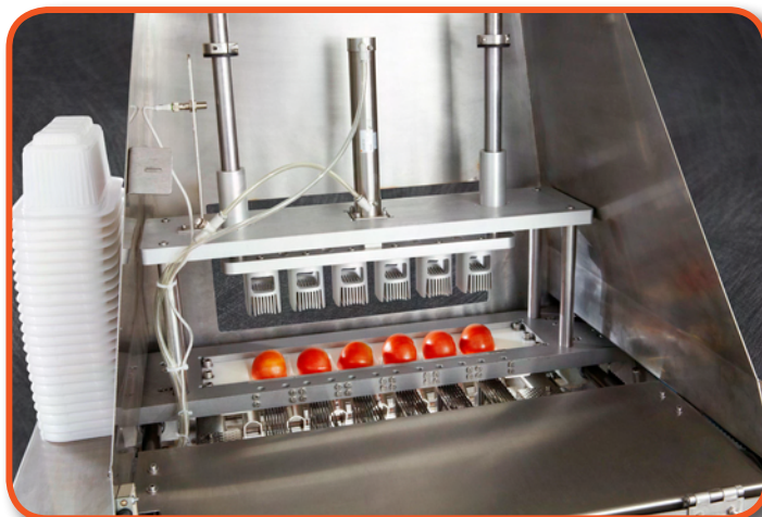
The back of the slicer may be easily opened for access to cleaning.