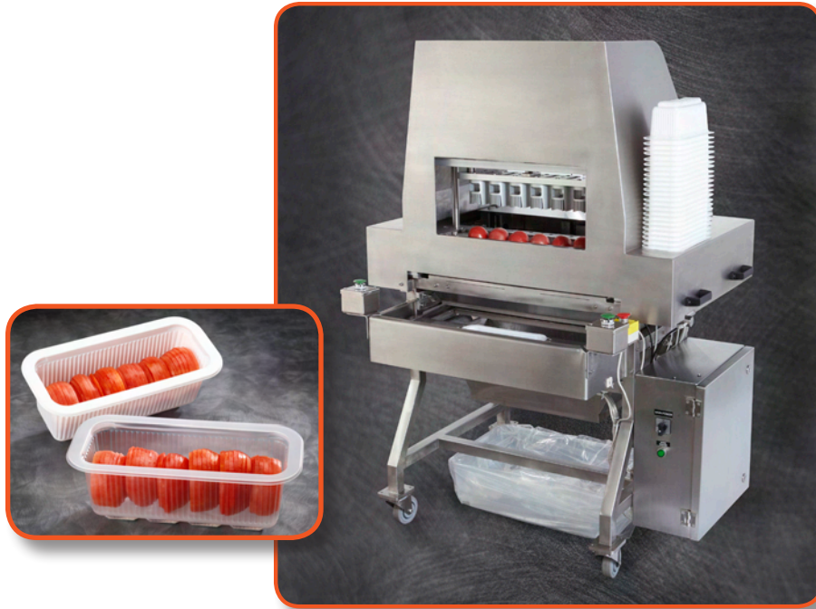
Tomato Slicer Model No. MCT 5

The MCT 5 Tomato Slicer has been specifically designed and engineered to produce precision cut tomato slices. The machine removes and collects the unwanted end pieces while placing the premium tomato slices neatly in the tray. The machine is easy to load and can be run using just one operator. The Tomato Slicer has built in safety features such as a safety hood to protect the operator when the machine is in operation.