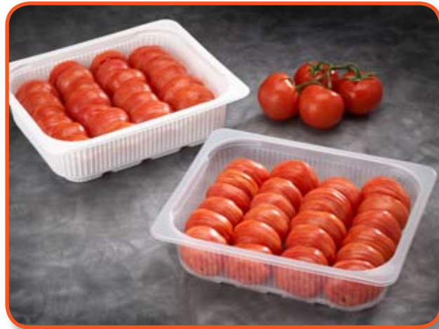
1/2 Steam Trays FPT-1/2R 3, 5 & 7 Lb. Size - 14 Day Shelf Life