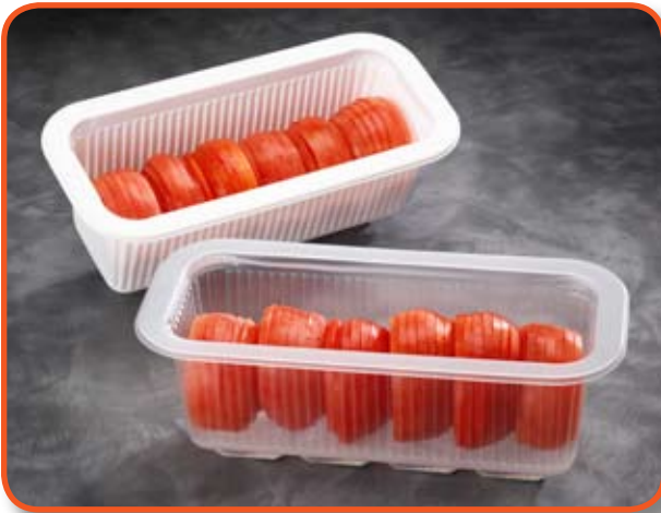
1/4 Steam Trays FPT-125D 2.5 Lb. Size - 14 Day Shelf Life