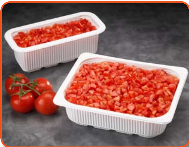
1/4 and 1/2 Steam Trays 2.5, 3, 5 & 7 Lb. Size - 14 Day Shelf Life