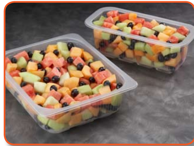
1/4 and 1/2 Steam Trays 2.5, 3, 5 & 7 Lb. Size - 12 Day Shelf Life

The Company's Fresh-R-Pax Food Safe Absorbent Packaging is used to Improve the Freshness and Extend the Shelf Life of Fresh-Cut Products such as Celery, Peppers, Onions, Cucumbers, Sliced and Diced Tomatoes and a variety of Fresh-Cut Fruit Items including Watermelon, Cantaloupe, Honeydew Melon and Pineapple.