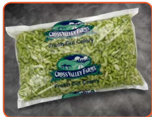
FPP-880 Pouch 8 Lb. Size - 18 Day Shelf Life

The Company's Fresh-R-Pax Food Safe Absorbent Packaging is used to Improve the Freshness and Extend the Shelf Life of Fresh-Cut Products such as Celery, Peppers, Onions, Cucumbers, Diced Tomatoes and a variety of Fresh-Cut Fruit Items including Pineapple, Orange and Lemon Wedges.