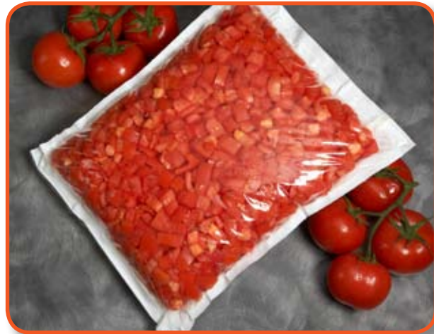
FPP-440 Pouch 5 Lb. Size - 14 Day Shelf Life