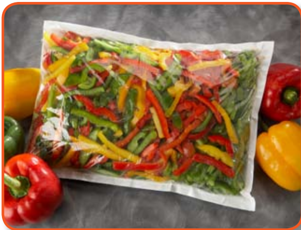
FPP-880 Pouch 8 Lb. Size - 12 Day Shelf Life