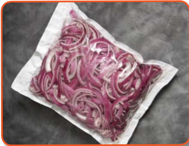
FPP-440 Pouch 5 Lb. Size - 14 Day Shelf Life